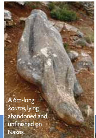
A 6m-long kouros , lying abandoned and unfinished on Naxos.

importance: the diaspora of tiny islands (including Keros) in the lee of Naxos and Amorgos, for instance, or those to the north and east of Alonnisos in the Sporades, where prehistoric communities and commerce flourished. ➡