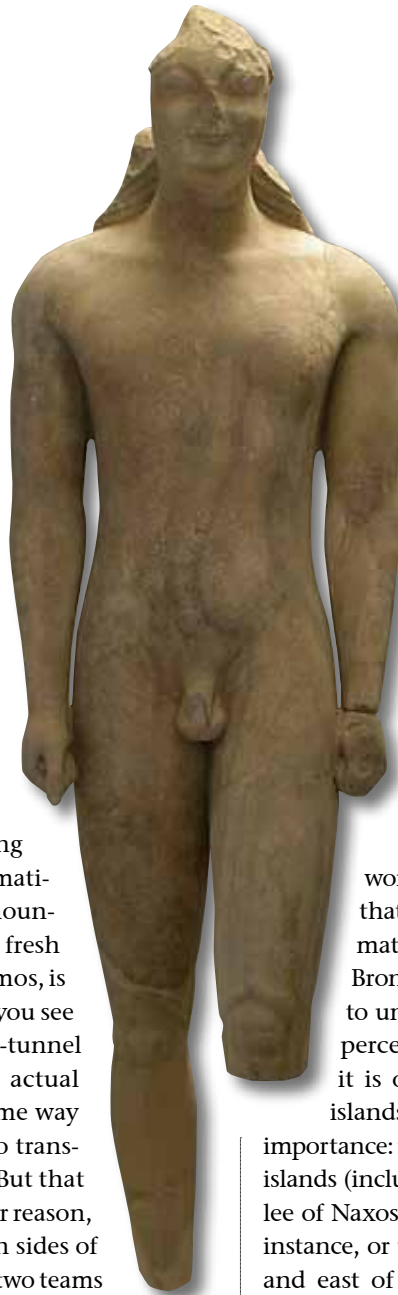
An example of a finished kouros from Samos.

The combined brains of my talented student-groups, year after year, failed to come up with the explanation. In the end it is not that difficult. The work simply required an ingenious combination of marker posts, plumb bobs, water-levels and shafts dug down from the surface with hanging posts for alignment, together with that quality of clear, theoretical thinking which the Island Greeks possessed in abundance. The problem of water-supply for Samos could have been solved by a