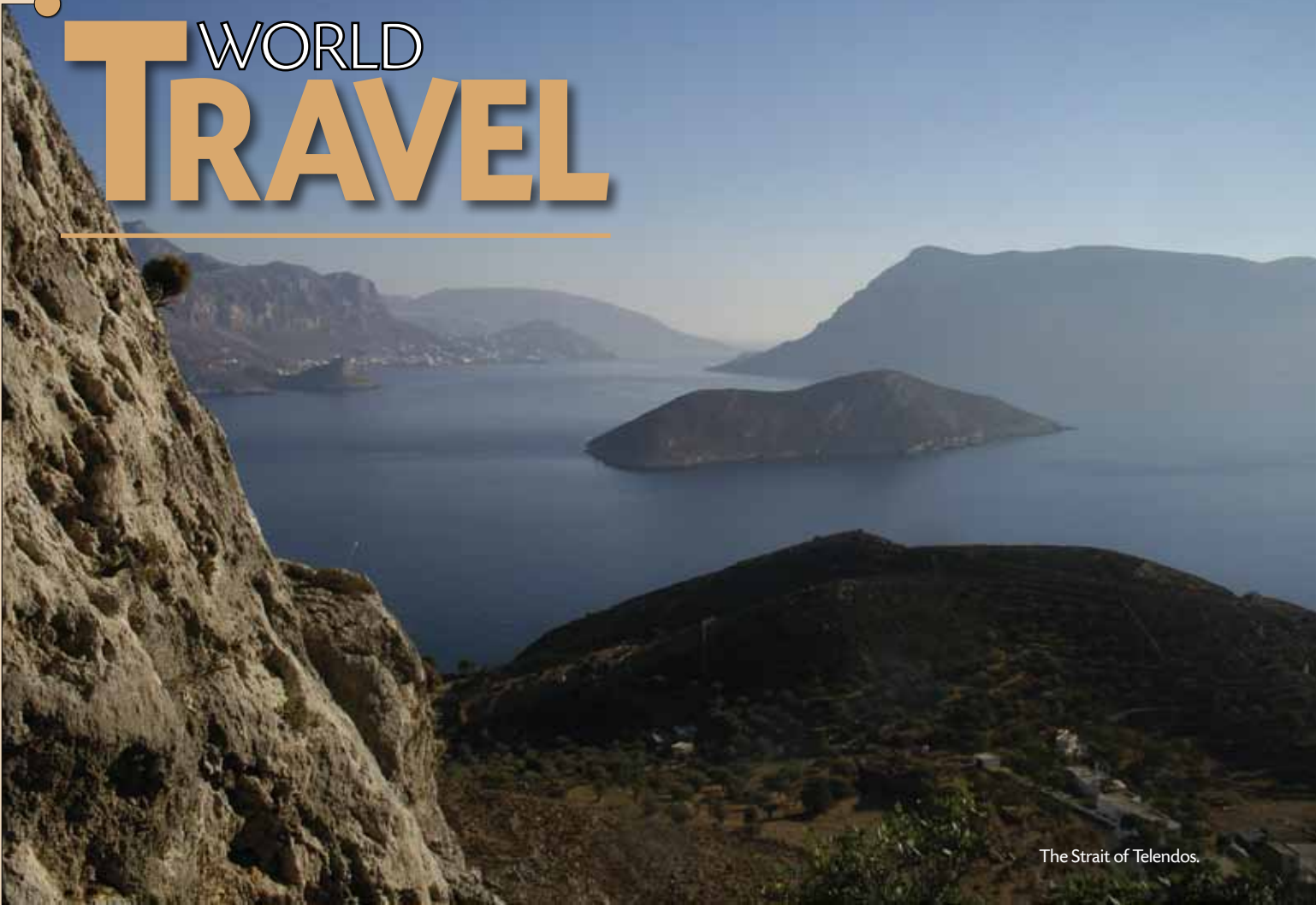
The Strait of Telendos.