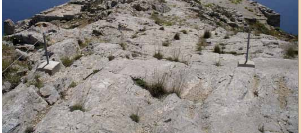
ABOVE The Terrace of the Ephebes, at Ancient Thera on Santorini.