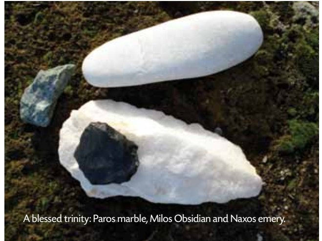
A blessed trinity: Paros marble, Milos Obsidian and Naxos emery.

Nobody would sensibly deny the huge importance and achievements of Athens; but should we, by the same token, overlook the contributions to the arts and sciences, and to the evolution and thinking of the Hellenic world, of