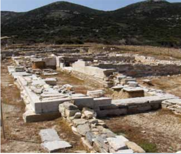
LEFT Remains of an Early Archaic sanctuary on Despotikó.

the diversity of its styles and periods. And some notable political obstacles have been overcome too: the Ottoman monuments still remaining in Greek territory, as well as the extraordinary legacy of Italian colonial architecture of the 1920s and 1930s in Leros, Kos and Rhodes, are now starting to receive the attention they deserve.