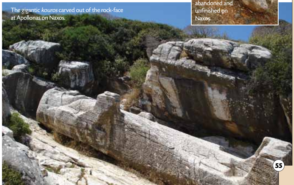
The gigantic kouros carved out of the rock-face at Apollonas on Naxos.