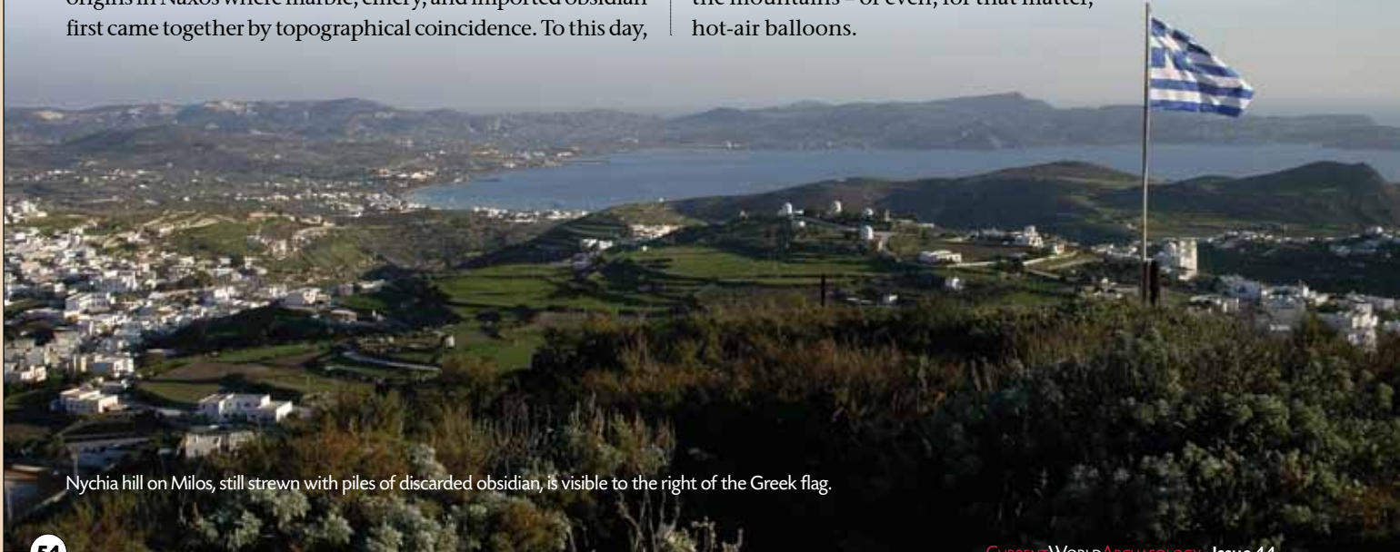
Nychia hill on Milos, still strewn with piles of discarded obsidian, is visible to the right of the Greek flag.

cated to chthonic deities – possibly those two rebellious giants, Otus and Ephialtes, twin sons of Poseidon, who perished on Naxos and were honoured as the protectors of quarrymen. Supposing the colossal Flerio kouroi were originally destined for this sanctuary rather than, say, Delos or the city of Naxos? Then there would be no need to posit special transportation ramps stretching for miles across the mountains – or even, for that matter, hot-air balloons.