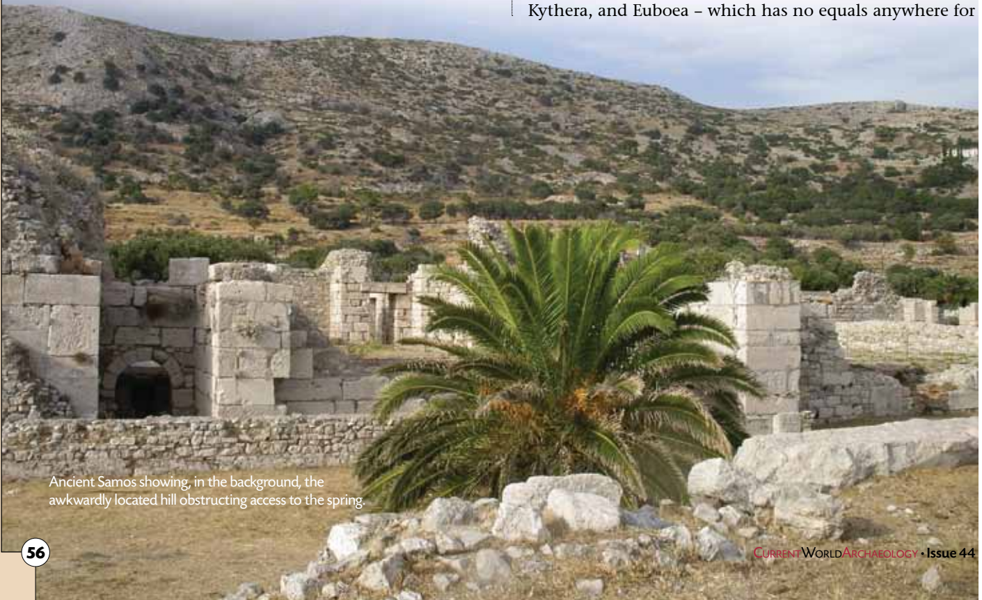
Ancient Samos showing, in the background, the awkwardly located hill obstructing access to the spring.

The last decade – the period in which I have been working on these books – has seen a ferment of archaeological and historical activity in the Islands. New, thoughtfully designed museums for individual islands, especially in the Dodecanese are being created. Major new excavations are under way – from the fortified Bronze Age town at Palamari on Skyros, to Early Christian remains at Eresos on Lesbos. Wide-ranging conservation-work has helped preserve a patrimony of Byzantine painting in the churches of Naxos, Kythera, and Euboea – which has no equals anywhere for