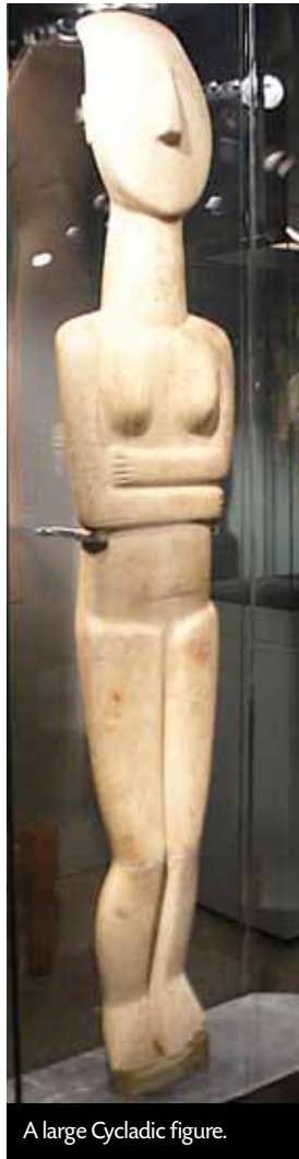
A large Cycladic figure.

Naxos, like Paros its close neighbour, still produces the finest sculptural marble in the world. But Naxos also produces in one ravine of its eastern sea-board a curious and unprepossessing mineral known as emery. Its hard, granular texture will abrade and smooth the surface of marble to a soft, pellucid skin – without discolouring it. No wonder, then, that the long and distinguished tradition in Ancient Greece of cutting, shaping, and polishing marble as sculpture, has its origins in Naxos where marble, emery, and imported obsidian first came together by topographical coincidence. To this day,