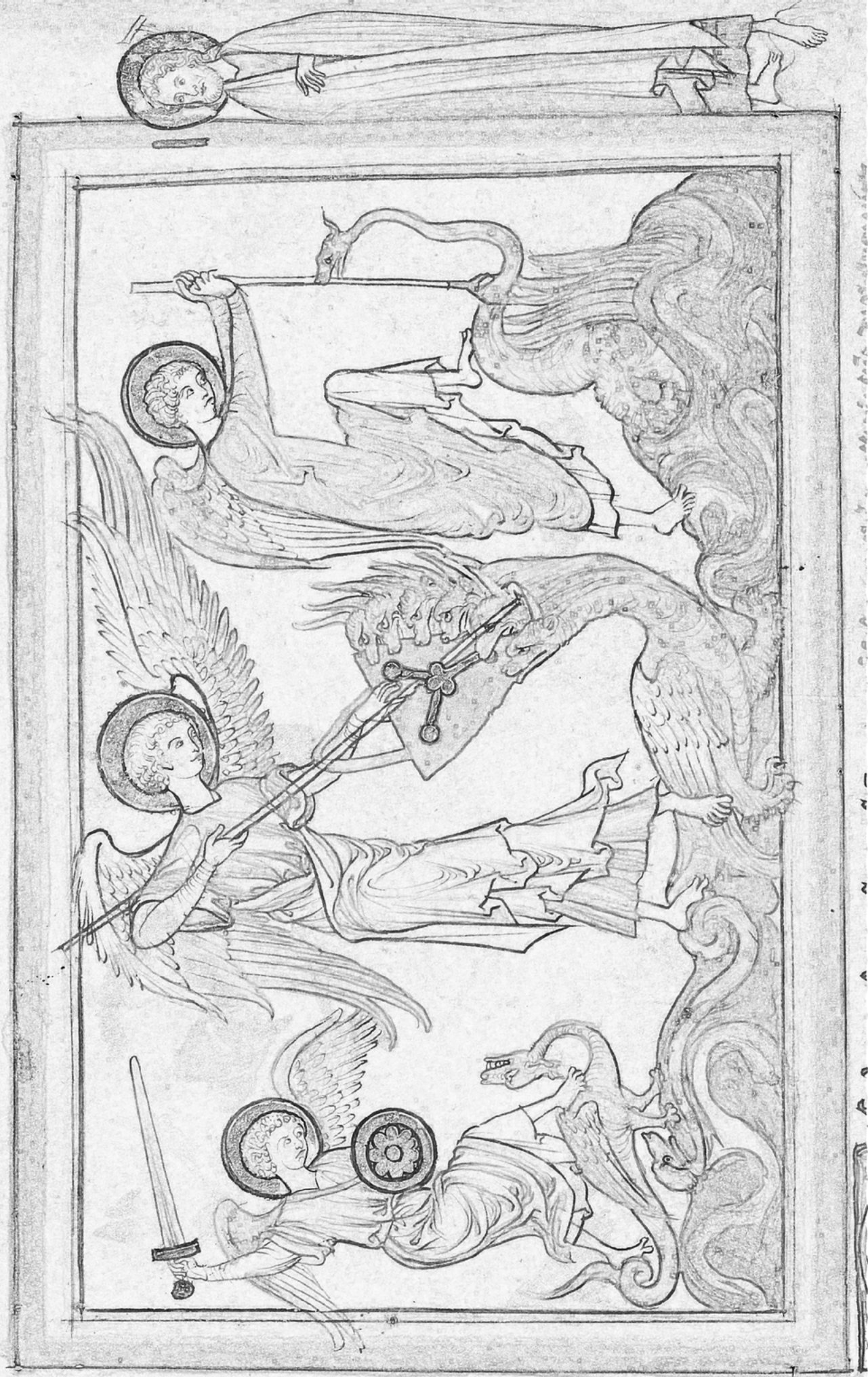
The Battle Between the Angel and the Dragon, about 1255-1260, Unknown. The J. Paul Getty Museum. https://bit.ly/207E1ga