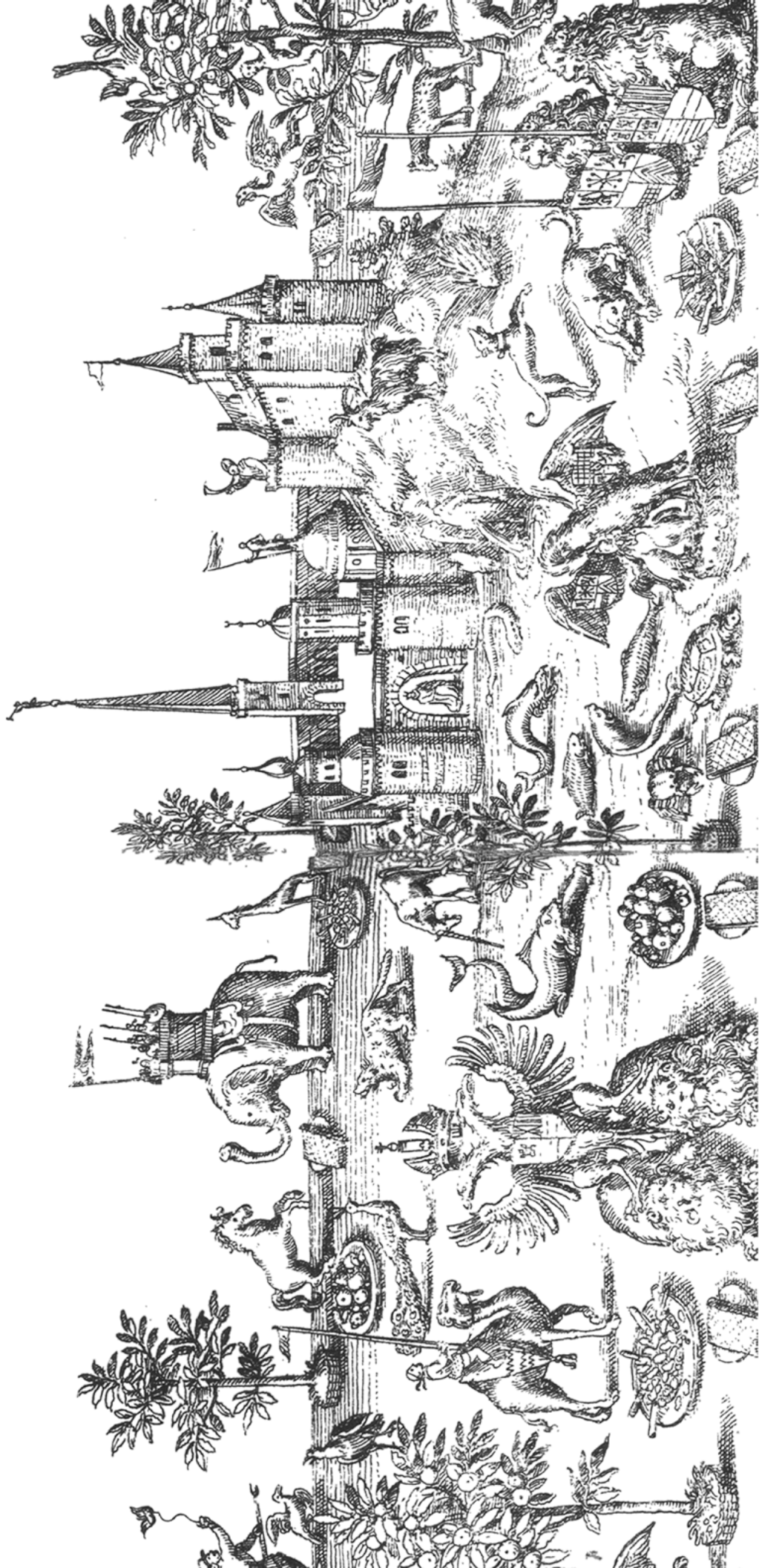
Detail of a table with sugar figures for the marriage of Johann Wilhelm, Duke of Jülich, Frans Hogenberg, 1587.