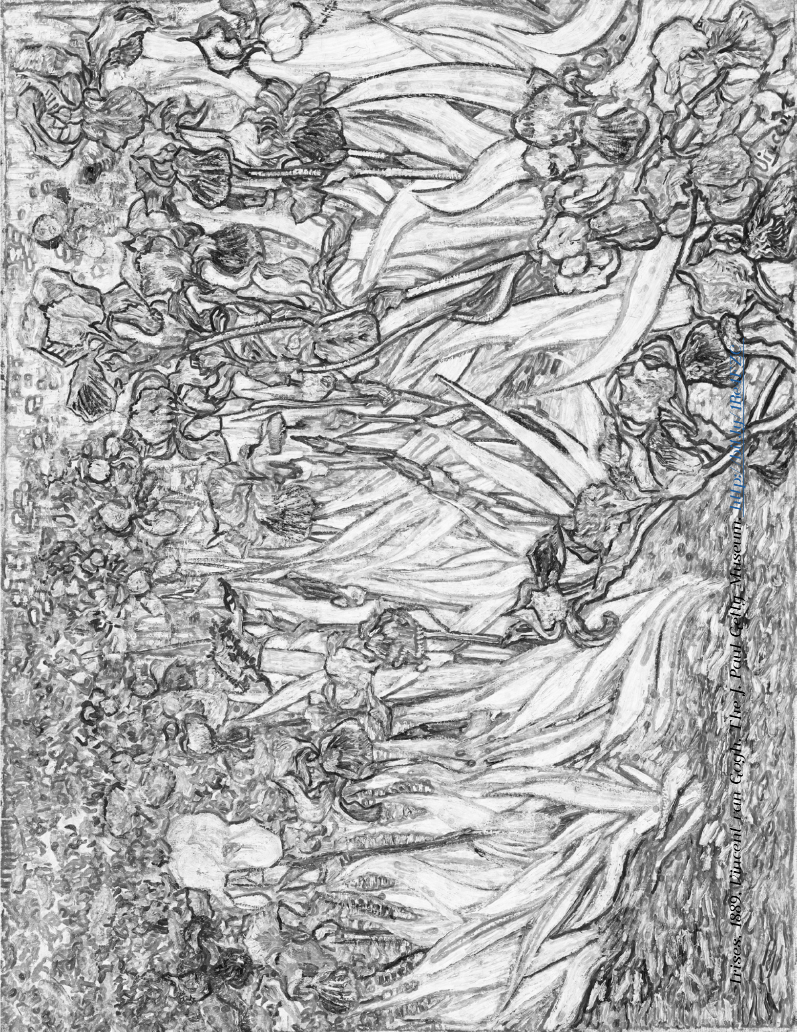
Irises, 1889, Vincent van Gogh, The J. Paul Getty Museum. http://bit.ly/IRIS2019